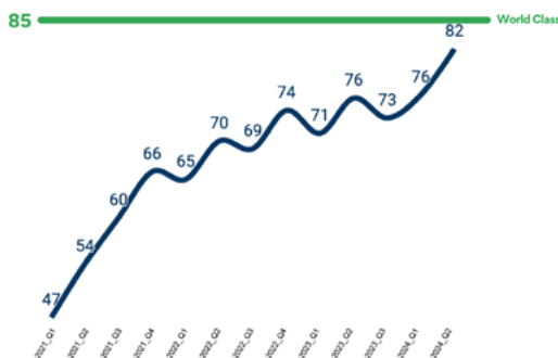
IT Experience Score Over Time